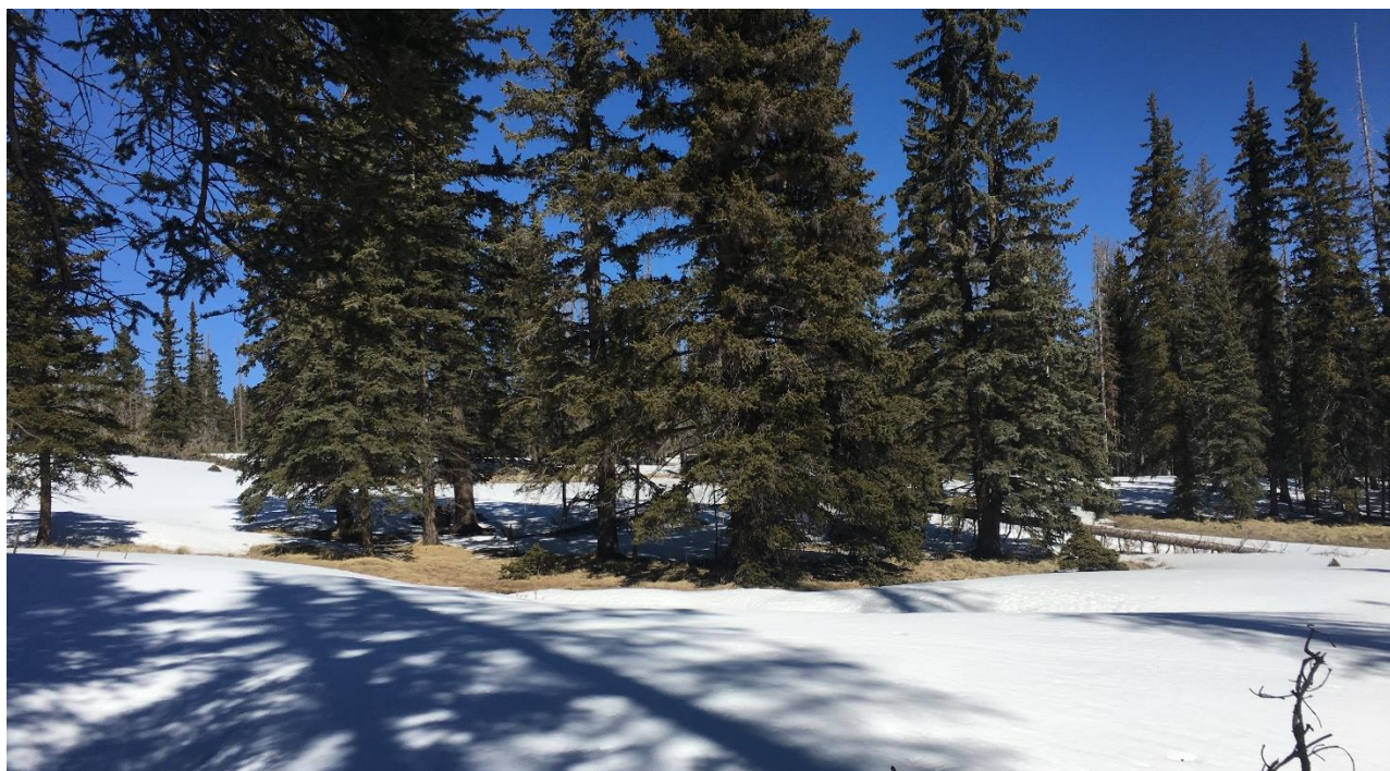
Figure 1. Image at one of our study sites depicting deep snow in areas shaded by trees and shallow / absent snow in sunnier areas, particularly on the warm sides of canopy stands.

Changes in forest structure have the potential to exacerbate or mitigate snowpack changes brought about by these climatic changes. Forest structure exerts a strong control on snowpack because of the interplay of various factors such as interception and shading from the trees. For example, interception reduces the amount of snow reaching the ground, while shading by terrain and/or forest vegetation protects the snowpack on the ground from sublimation loss (e.g. Musselman et al., 2008; Rinehart et al., 2008, Veatch et al., 2009; Figure 1). For example, this tradeoff means that despite causing a decrease in interception, forest removal may result in equal or reduced SWE (Harpold et al., 2014; Biederman et al., 2014). Furthermore, the relative importance of these factors depends on climate and topography. For example, steep north facing slopes, which are already shaded may be more sensitive to changes in interception than to forest shading, while on sunny south facing slopes, shading from nearby trees can be important for retaining snowpack.